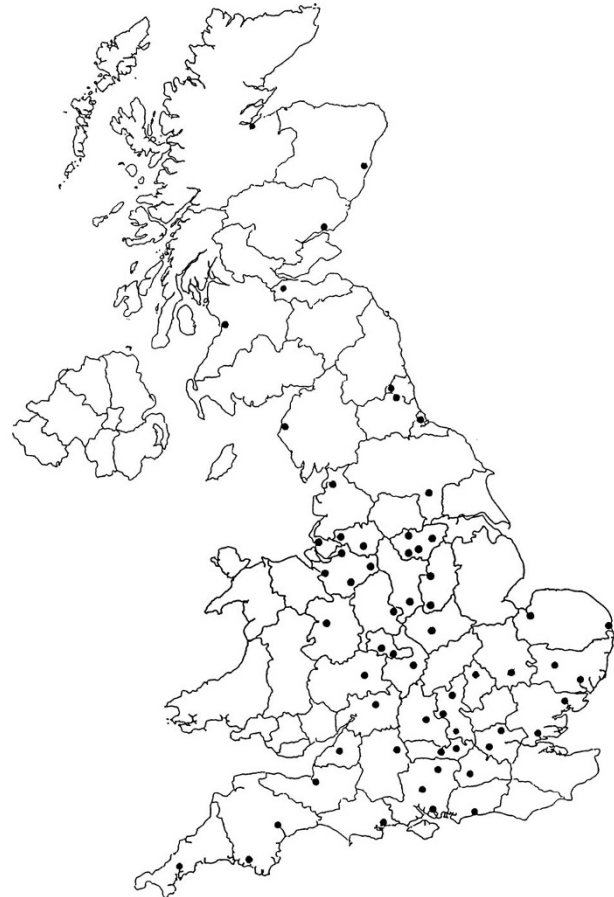
Location of UK National Health Service Breast Screening Centres that began recruitment into the Million Women Study before December 1998.

Figure 2 shows the numbers of questionnaires returned to the CEU between May 1996 and June 1999. More than 800 000 questionnaires had been returned by the middle of 1999, and according to this accrual rate it is estimated that a cohort of 1 million women will have been recruited by early in the year 2000.